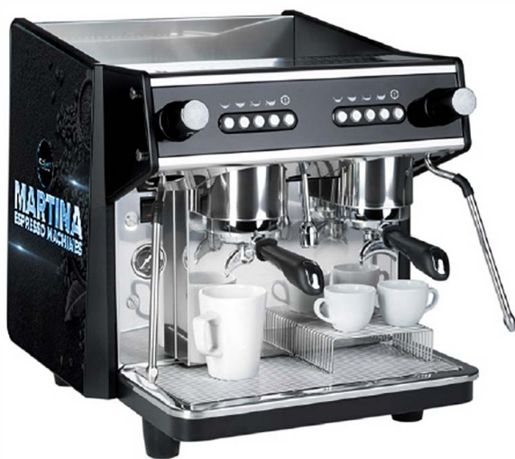
2 GROUP COMPACT (featuring two steam wands)

THE MARTINA IS CURRENTLY AVAILABLE IN THE FOLLOWING CONFIGURATIONS: